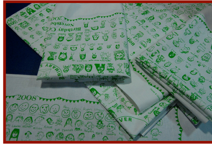
Keep a look-out for our new fundraising project: keepsake tea-towels featuring the MBTS students' selfportraits.

The MBTS Parent Guild Executive Committee.